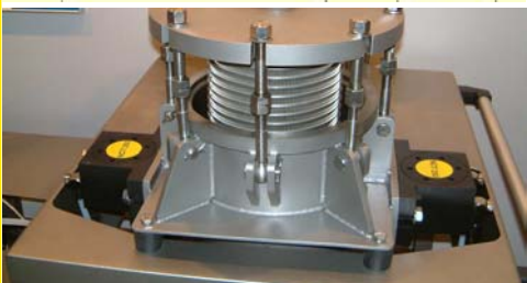
Sifting of fine grained products

* dimensions for mounting horizontal, bore ØE